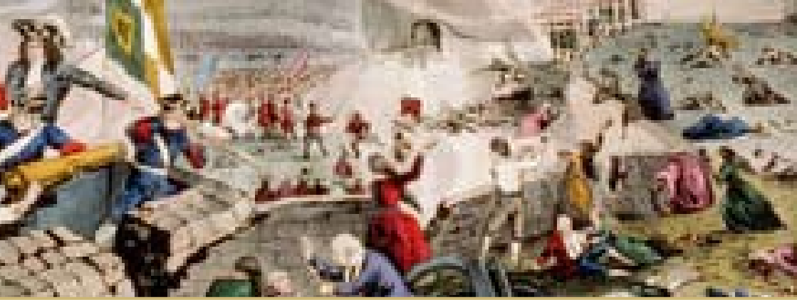
Siege of Limerick

However, he withdrew his cavalry at a crucial stage at the Battle of Aughrim. At the siege of Limerick he was court marshalled for treachery and was saved from execution owing to the commencement of negotiations that would culminate in the Treaty of Limerick.