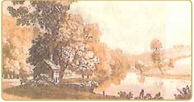
The Devil's Mill near Lucan

An amusing story concerning Luttrell's mortality is worth relating. The Dublin Post newspaper of the 2nd May 1811 reported the death of Henry Lawes Luttrell. Luttrell being very much alive called into the newspaper in a foul temper demanding an immediate retraction. Their following edition corrected their earlier death notice confirming that Luttrell was alive and well under the heading "Public Disappointment".