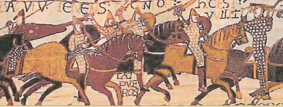
Battle of Hastings from Bayeux Tapestry