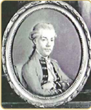
Henry Lawes Luttrell, Second Earl of Carhampton by H.D. Hamilton