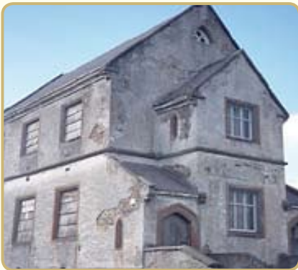
Porterstown National School

There is a local story that Lord Annaly refused the local priest a site for the building of a school. The story goes that the National school in Porterstown, now under restoration was built high in an attempt to thwart him, it being visible from the Castle. In fact Lord Annaly was generous to all religious denominations.