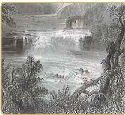
Salmon Weir at St. Wolstan's, Leixlip