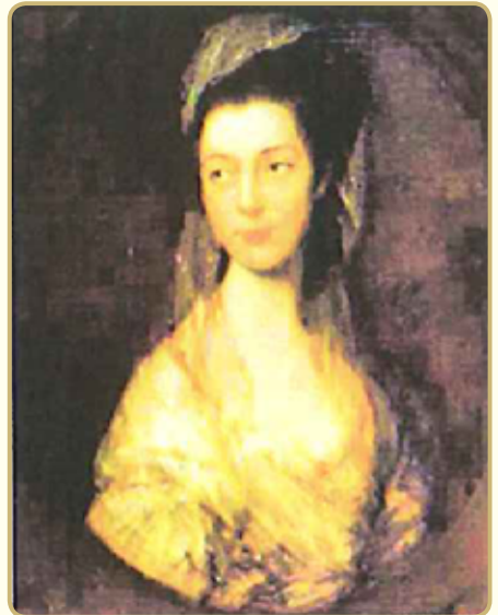
Lady Anne Luttrell by Thomas Gainsborough

The Lady Anne Luttrell who was Henry Lawes Luttrell's sister had a reputation for using her undoubted beauty to her advantage. Horace Walpole described her as 'having eyelashes half a yard long as a coquette beyond measure'. She was a widow when she lured the Duke of Cumberland's brother King George III into marriage. George III subsequently had Parliament enact a law prohibiting those in the royal succession from marrying without the permission of the monarch. The law is still in force. Another sister of the Lady Elizabeth lost so much money at the gambling tables that she was imprisoned for debt. She was later arrested as a pickpocket and died by self-administered poisoning.